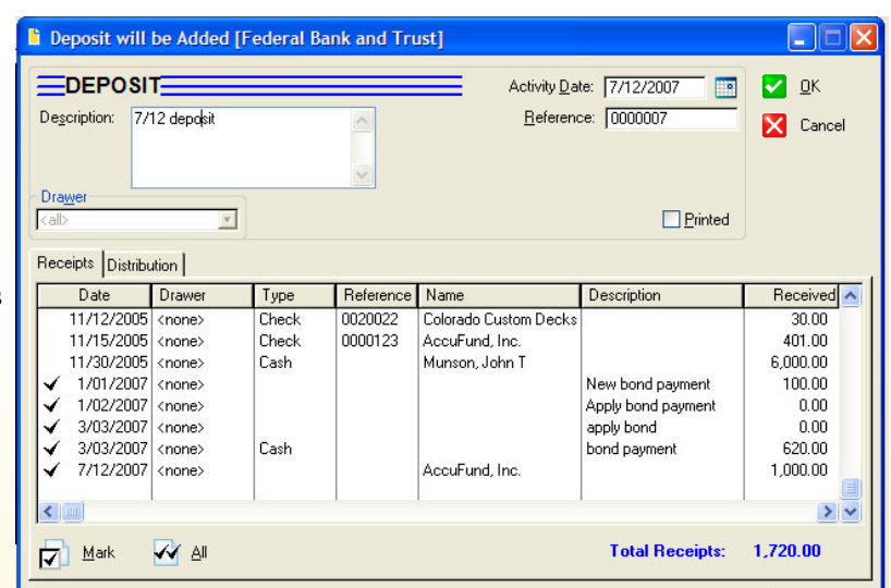
Once cash is received, the deposit screen is utilized to batch the receipts together by deposit. The deposit amount is posted to cash and included in the bank reconciliation.

AccuFund provides a set of default reports with the Cash Receipts component. These reports and forms may be modified or added to through the Reports/Forms Designer. Default reports include customer receipt form, deposit slip, deposit ticket, deposit log, receipt distribution recap, credit aging ,credit distribution, and customer credit recap.